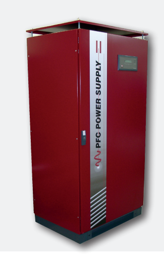
Fig.2 PFC rectifier type Wärtsilä JOVYREC GRP